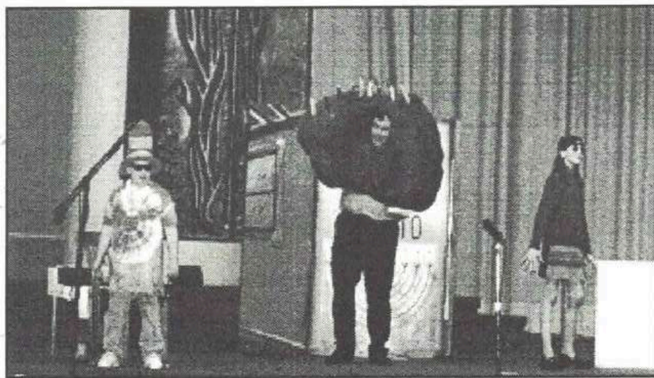
More than 1,200 people enjoyed performances of "The Odd Potato." Shown here is the performance for NCJW members, their families and other members of the community at Temple B'nai Jehudah.