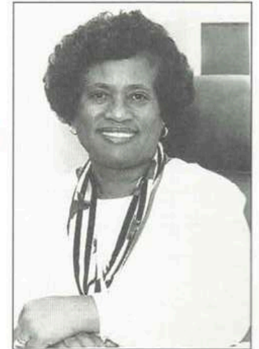
Dr. Joycelyn Elders