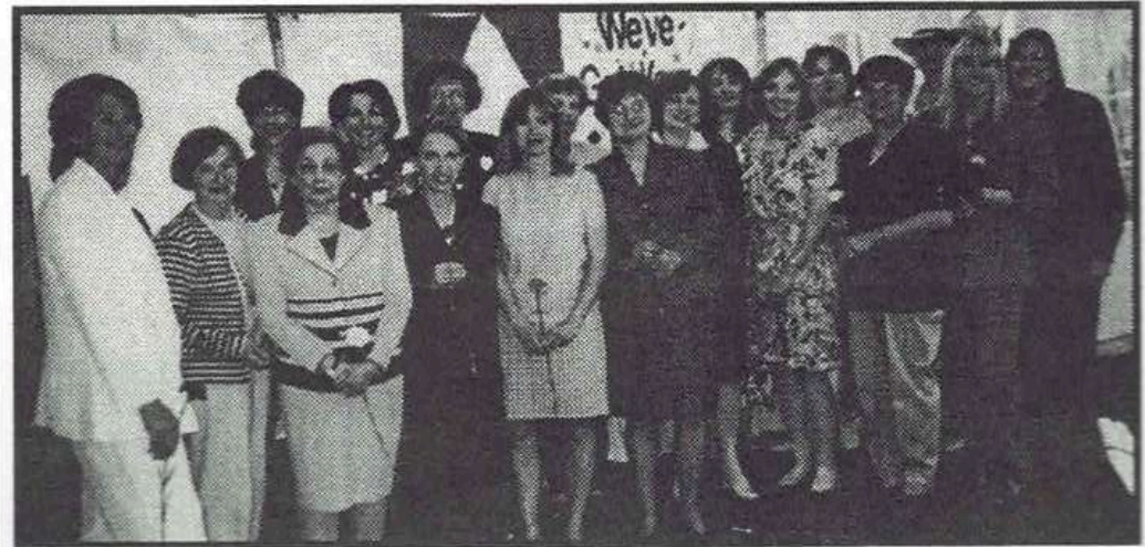
National Council of Jewish Women, Greater Kansas City Section, 1998 - 1999 Officers and Board of Directors.

member, one makes a serious commitment to spend the necessary time to bring this wonderful organization into the next century. Vision 2000, NCJW's newest strategic plan, represents the work of several dedicated, concerned members who want NCJW to continue its positive influence in our Jewish and secular communities."