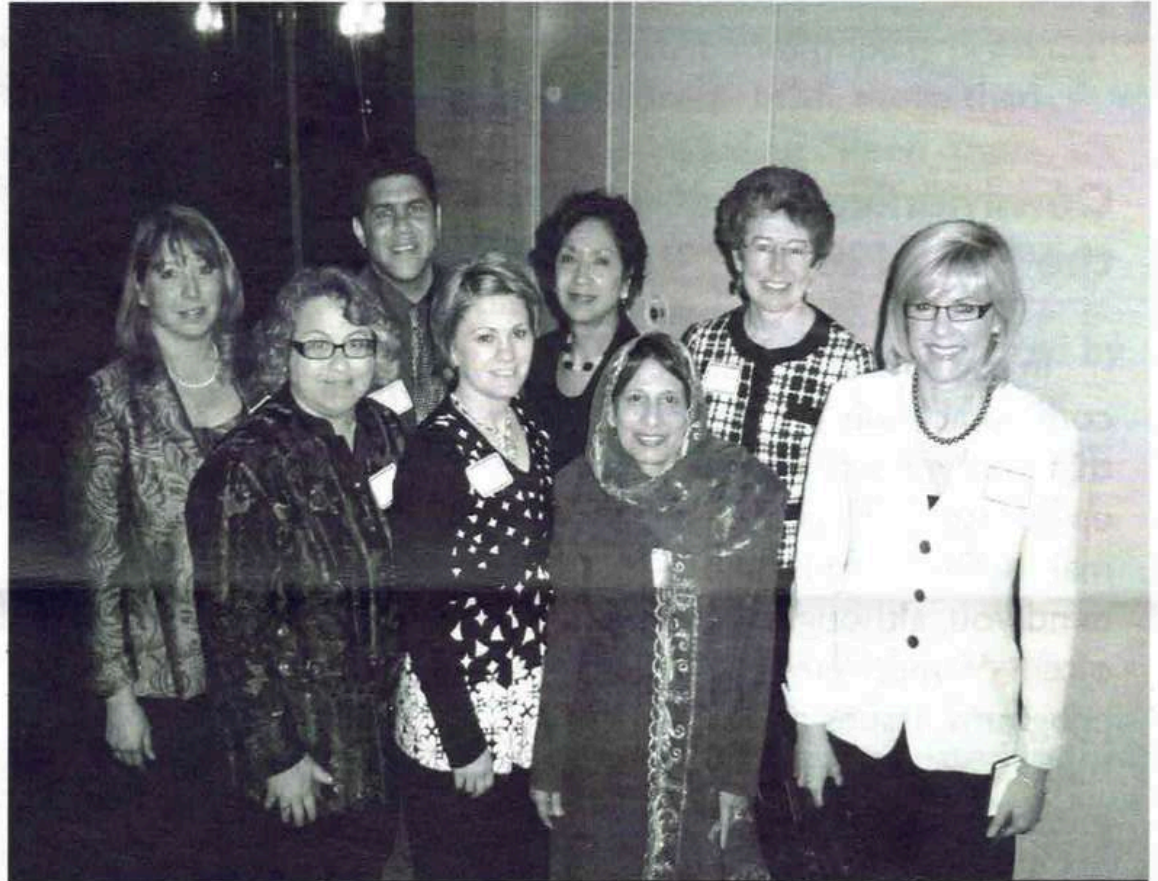
Interfaith Luncheon Committee and Speakers